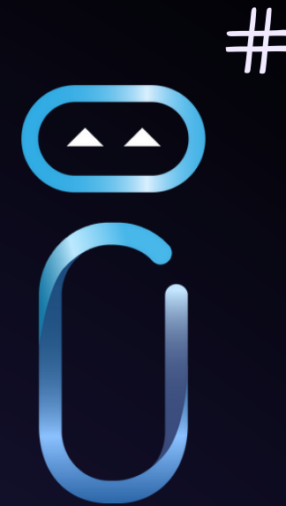
Pip Pilots Hedge